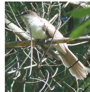
The cuckoo is easy to miss, a skulker in woods and thickets. This juvenile was relatively bold, seen near a trail in August 2014.

http://www.allaboutbirds.org/guide/black-billed_cuckoo/id