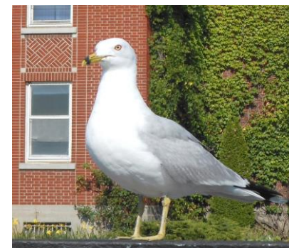
Above: a cheeky ring-bill displays typical adaptation to the human environment, perched on the box of a pick-up truck by Campbellford old town hall, 21 July 2012.

Bird identification, Cornell Lab of Ornithology: visit http://www.allaboutbirds.org/guide/ring-billed_gull/id